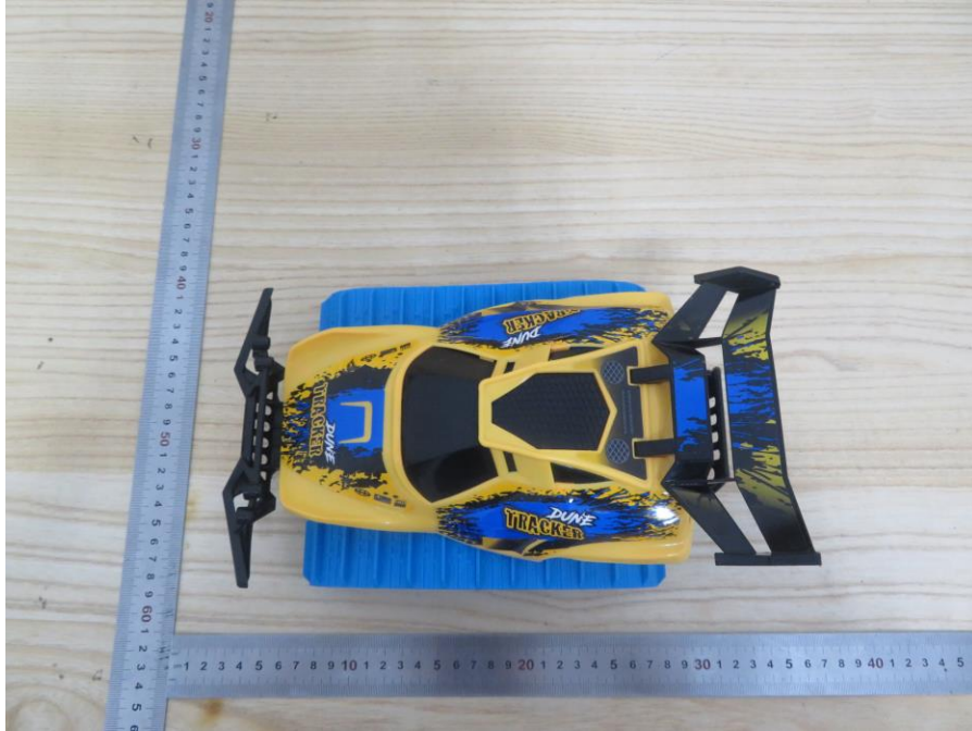
View of EUT-2