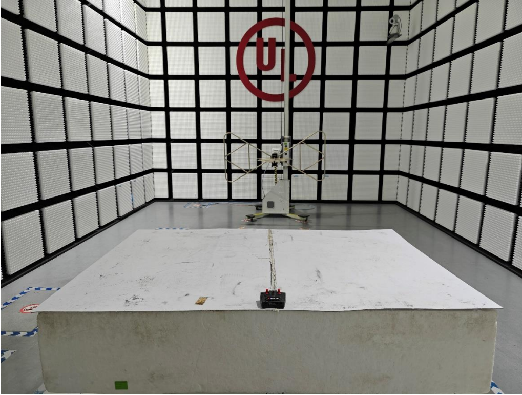
Radiated Disturbance below 30 MHz