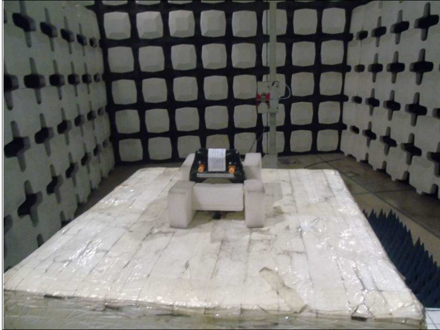
Frequency Range < Above 1GHz >