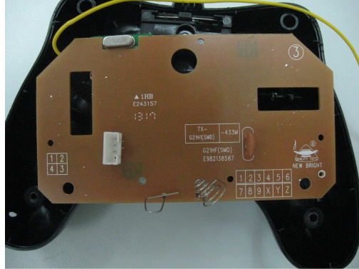
Inner Circuit Bottom View