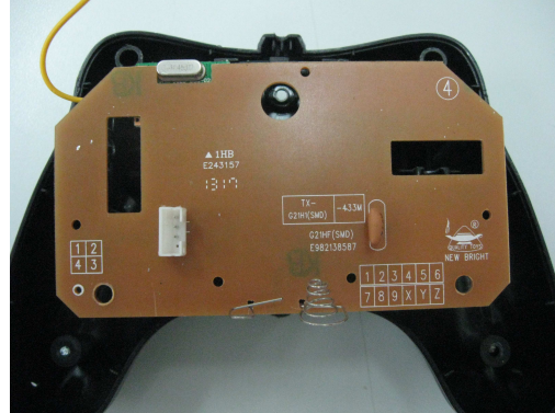
Inner Circuit Bottom View