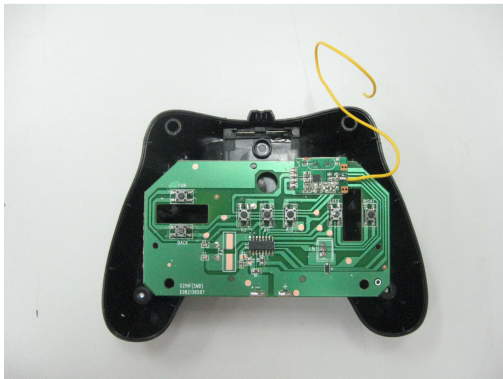
Front View of the internal Photo