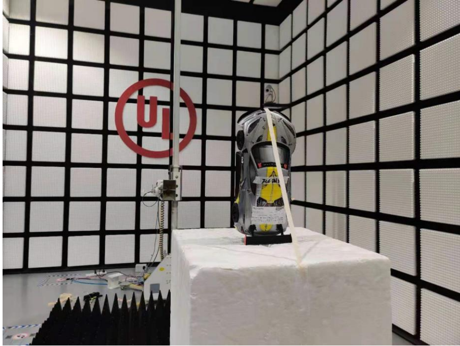
AC POWER LINE CONDUCTED EMISSIONS SETUP