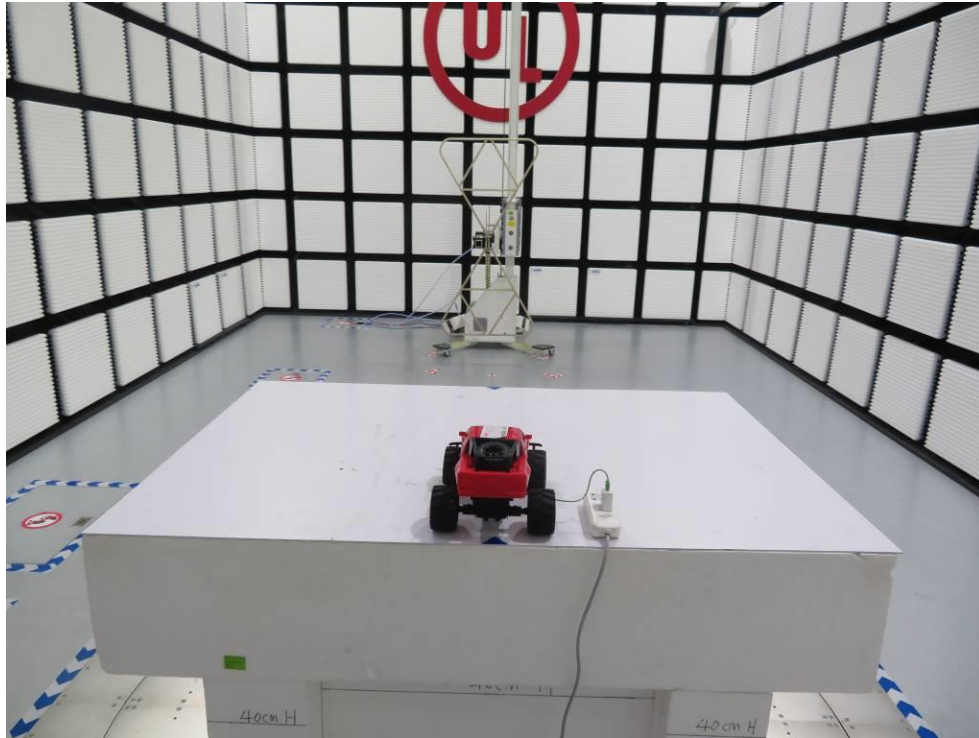
Radiated Disturbance above 1GHz