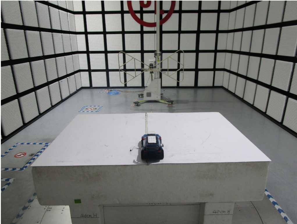
Radiated Disturbance below 30 MHz