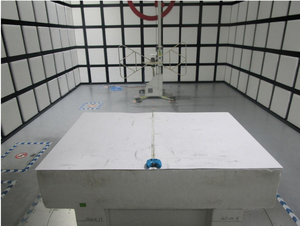
Radiated Disturbance below 30 MHz