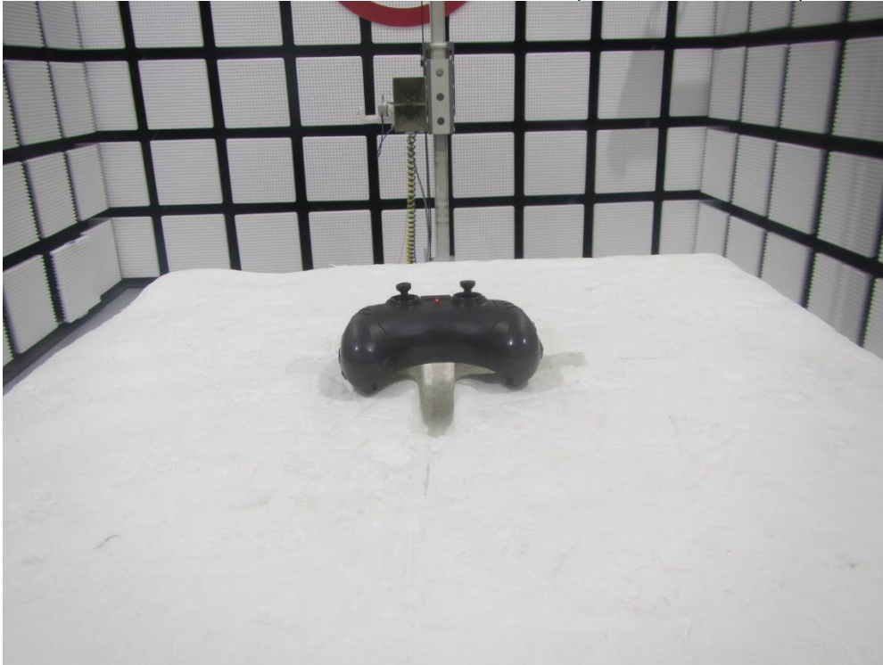
RADIATED RF MEASUREMENT SETUP (Above 1G – Y axis)