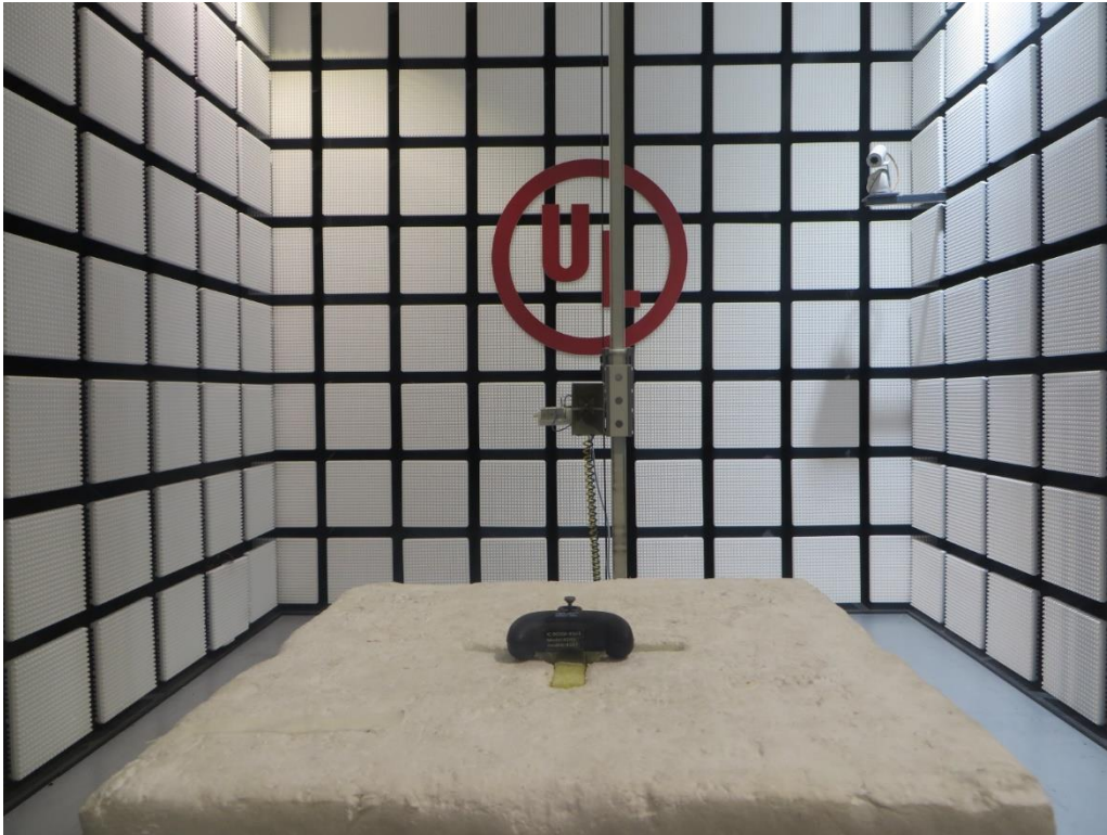
Radiated Disturbance Setup (Above 1 GHz-Y axis)