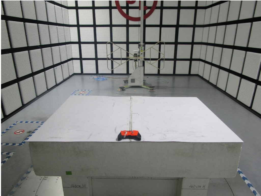
Radiated Disturbance below 30 MHz