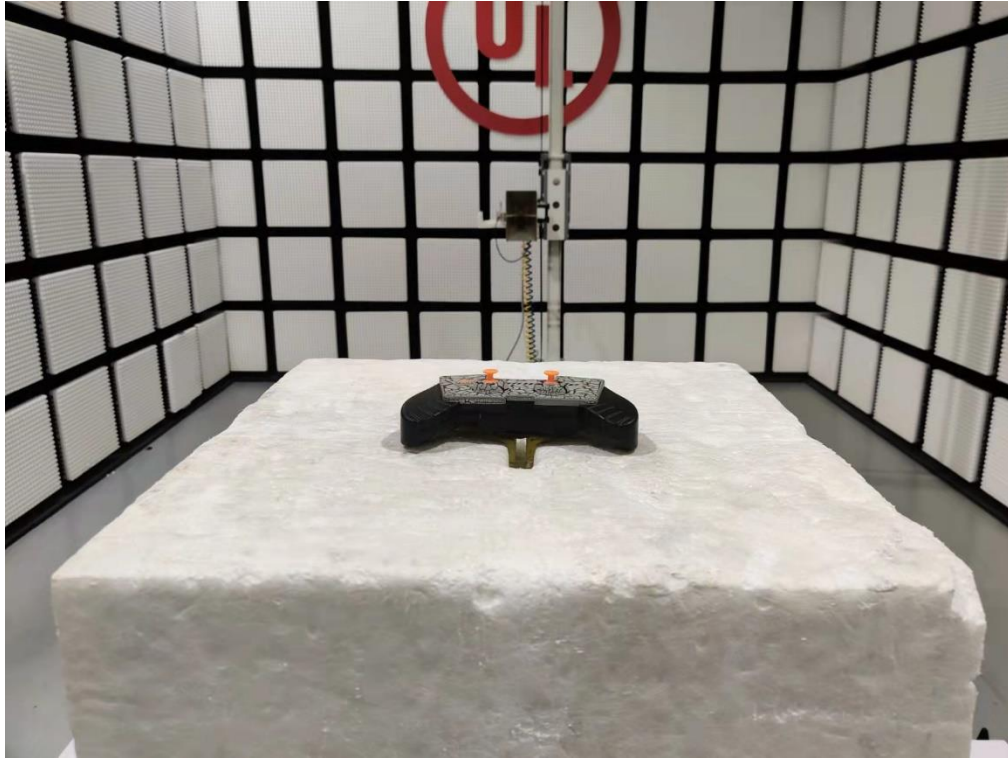
Radiated Disturbance Setup (Above 1 GHz – Y axis)