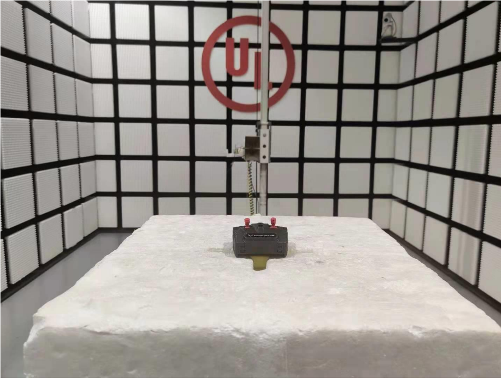
Radiated Disturbance Setup (Above 1 GHz – Y axis)