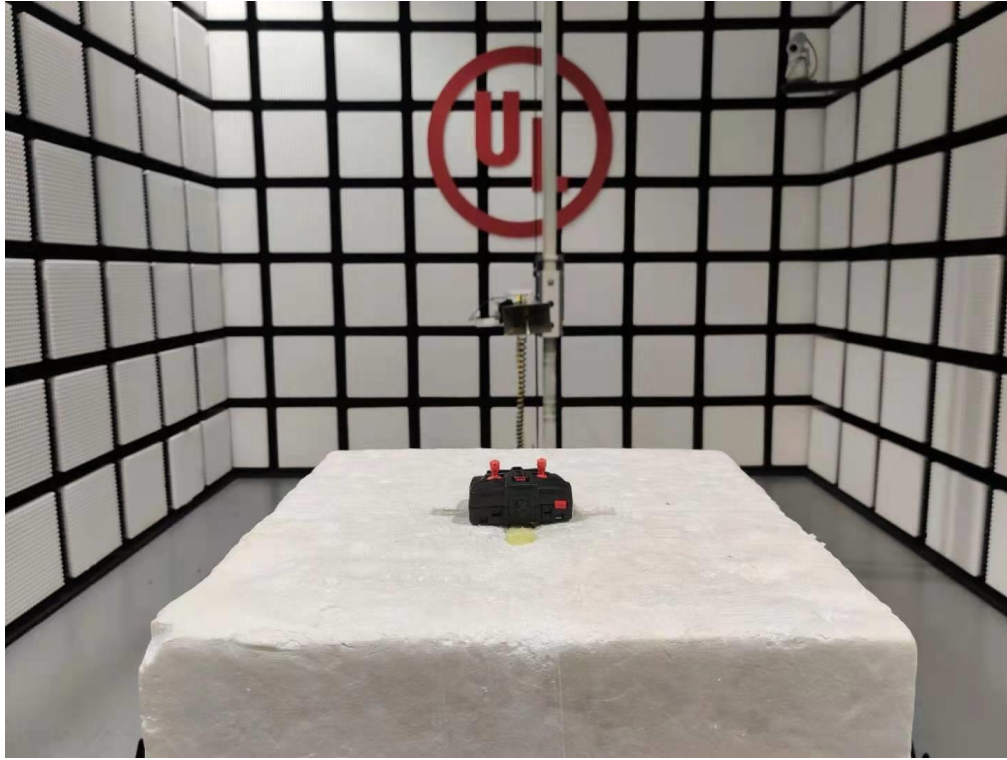
Radiated Disturbance Setup (Above 1 GHz – Y axis)