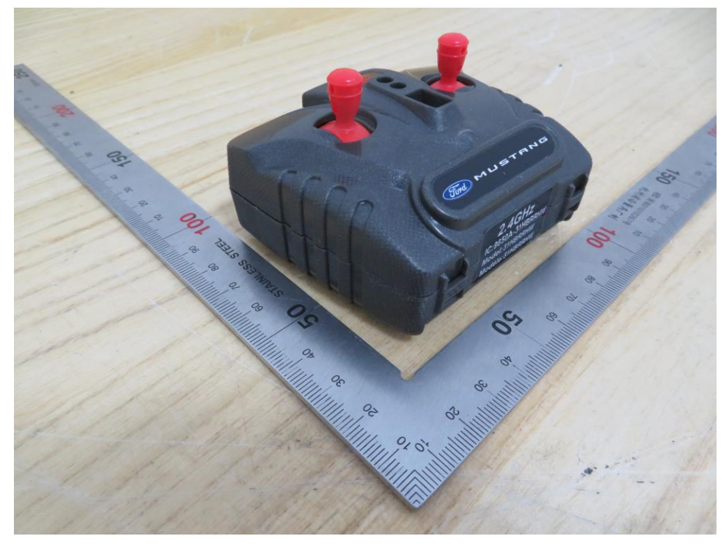
View of EUT (Version 1)-4