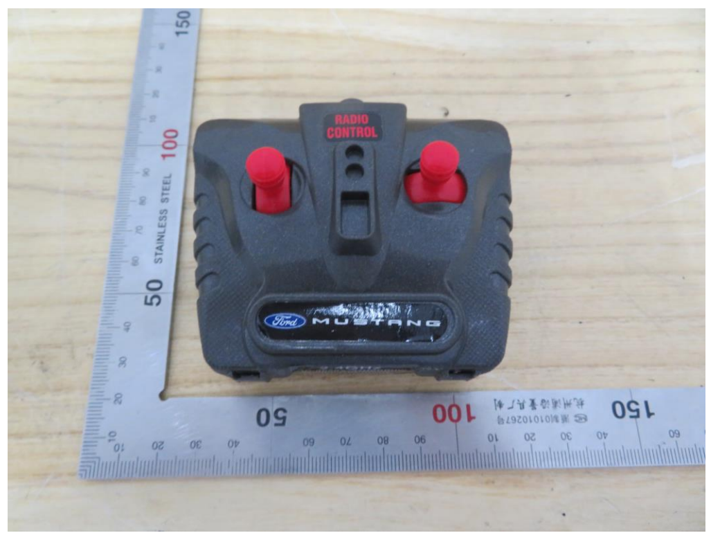
View of EUT (Version 3)-2