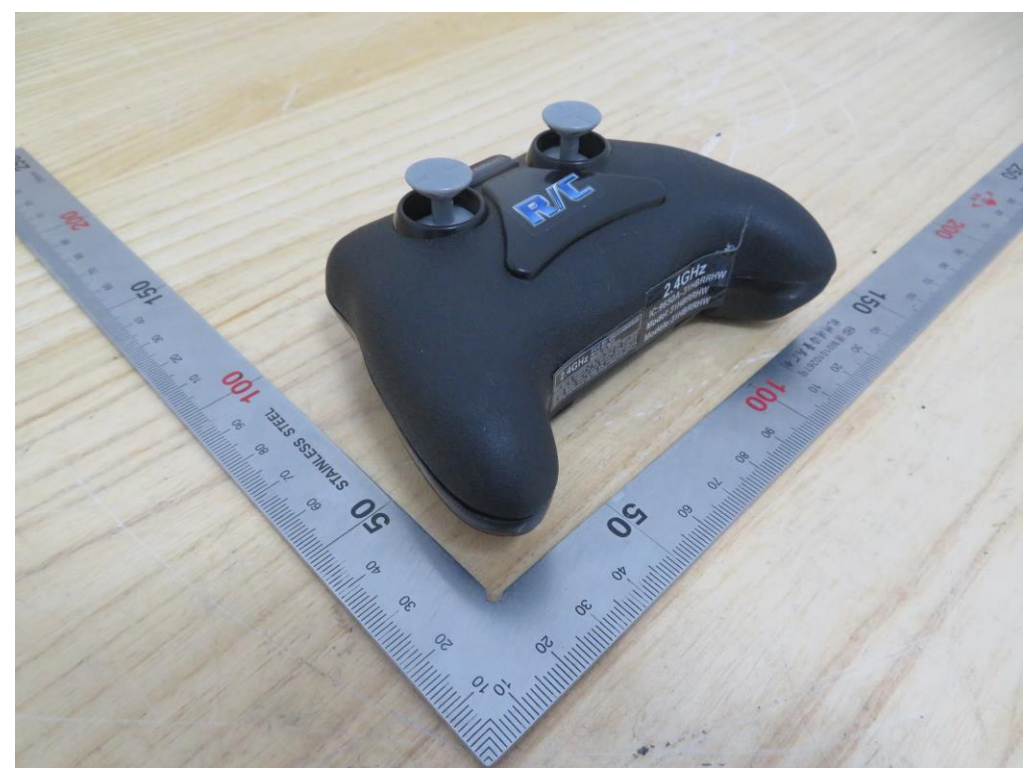
View of EUT (Version 2)-4