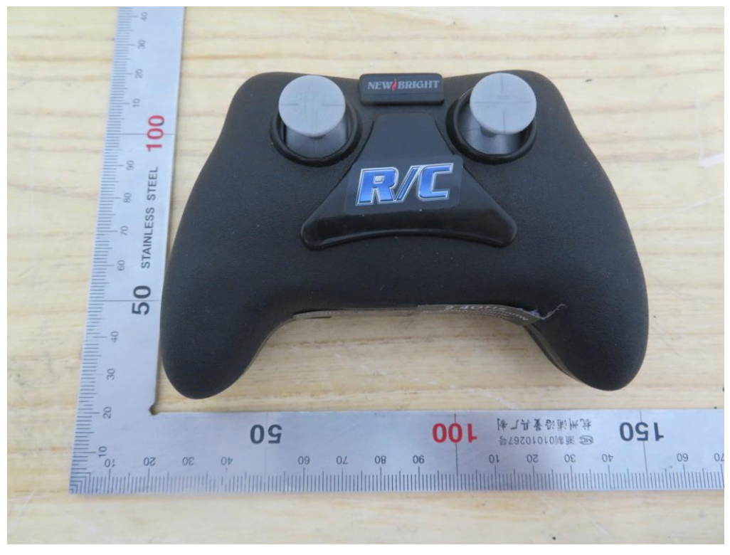
View of EUT (Version 2)-2