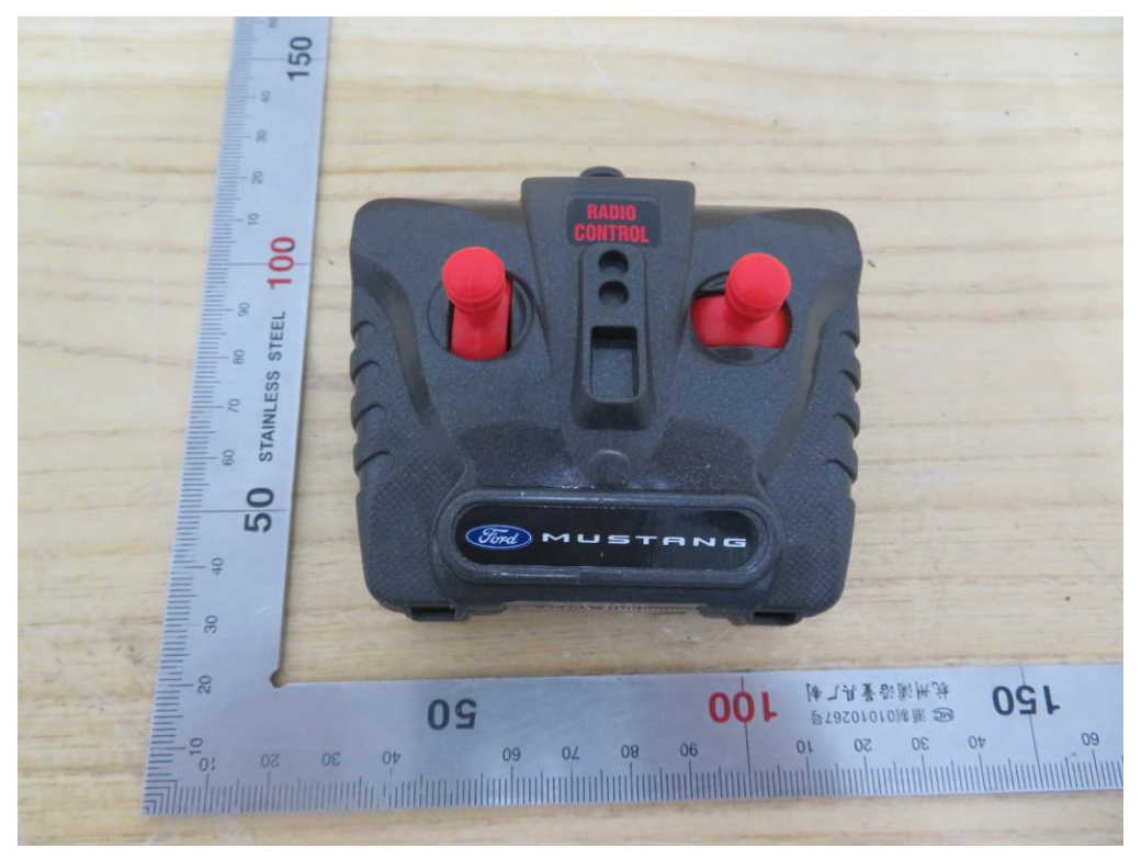
View of EUT (Version 1)-2