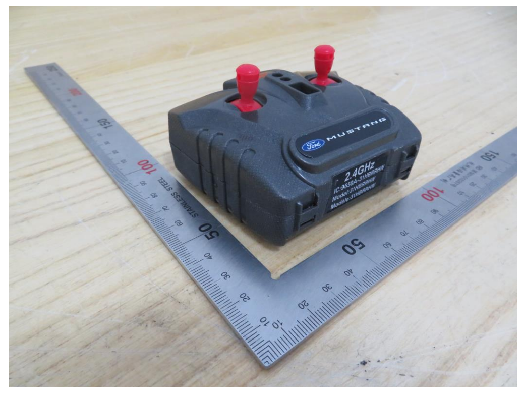
View of EUT (Version 3)-4