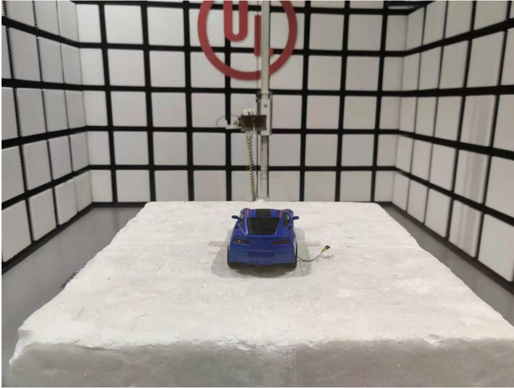
Radiated Disturbance Setup (Above 1 GHz – Y axis)