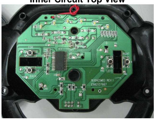
Inner Circuit Top View