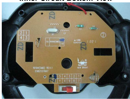
Inner Circuit Bottom View