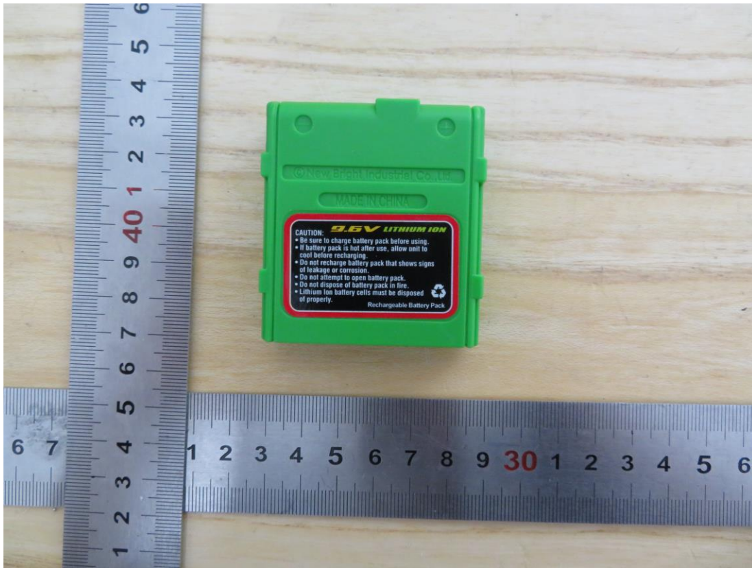
View of EUT-2