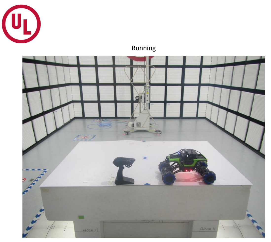
Radiated Disturbance Above 1G