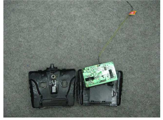
Rear View of the product (Internal)