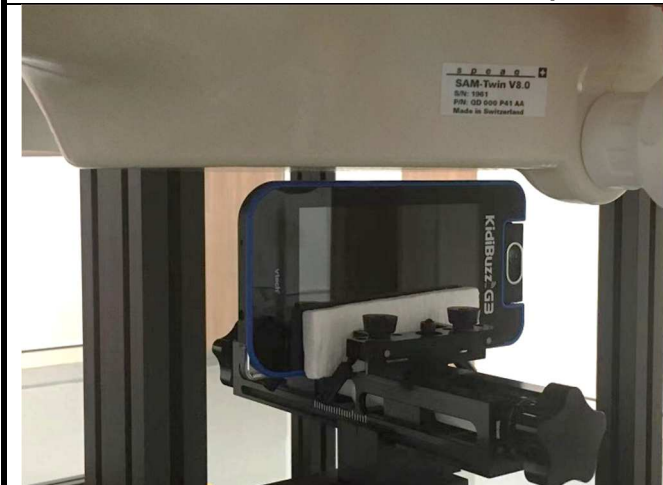
Left Side of EUT with 0.5 cm Gap