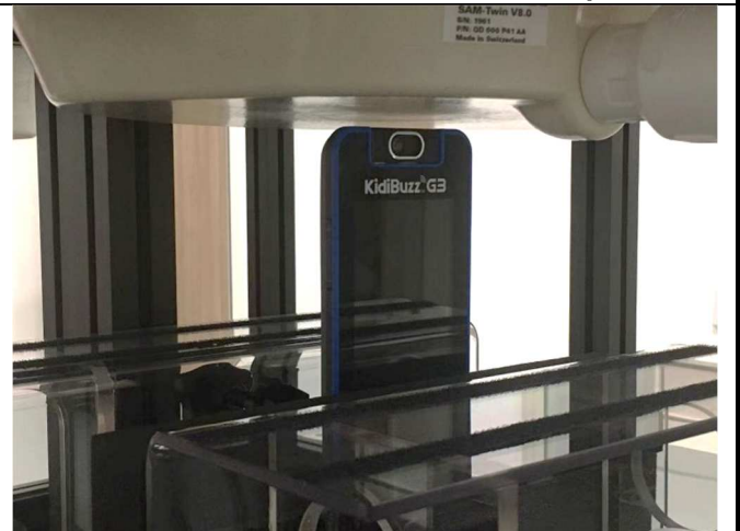
Top Side of EUT with 0.5 cm Gap