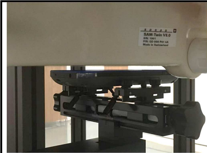
Front Face of EUT with 0.5 cm Gap