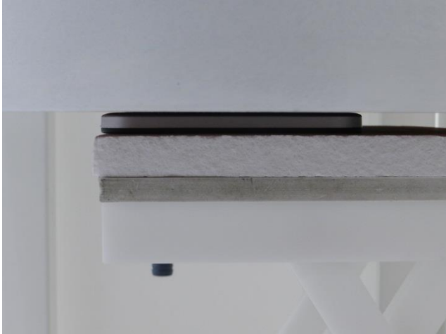
Bottom Face, Test Separation 0 cm