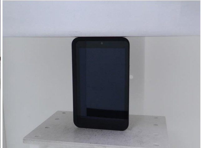
Edge1, Test Separation 0 cm