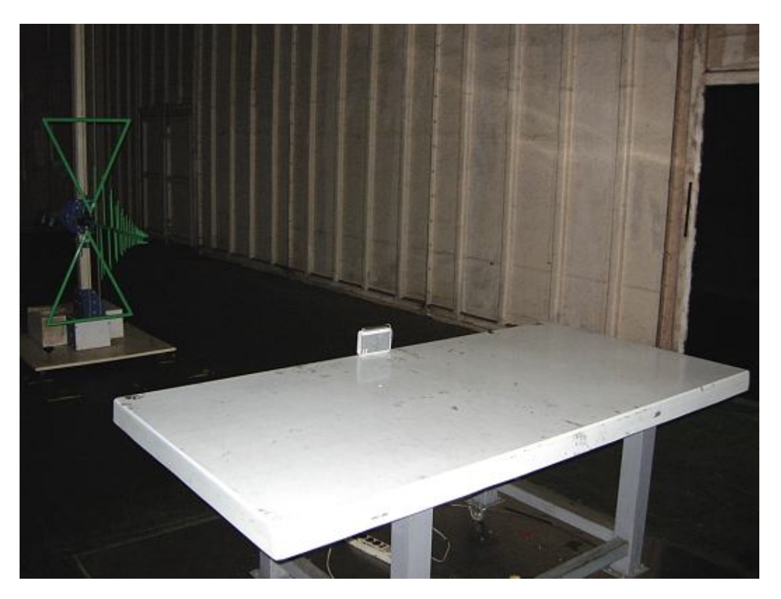
Front View of Radiated Test (with Battery)