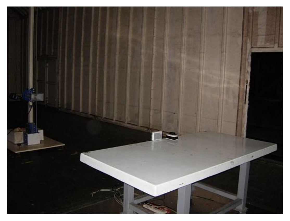
Back View of Radiated Test (Horn)