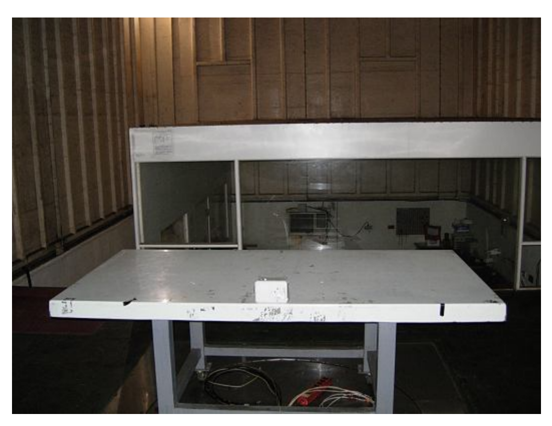
Back View of Radiated Test (with Battery)