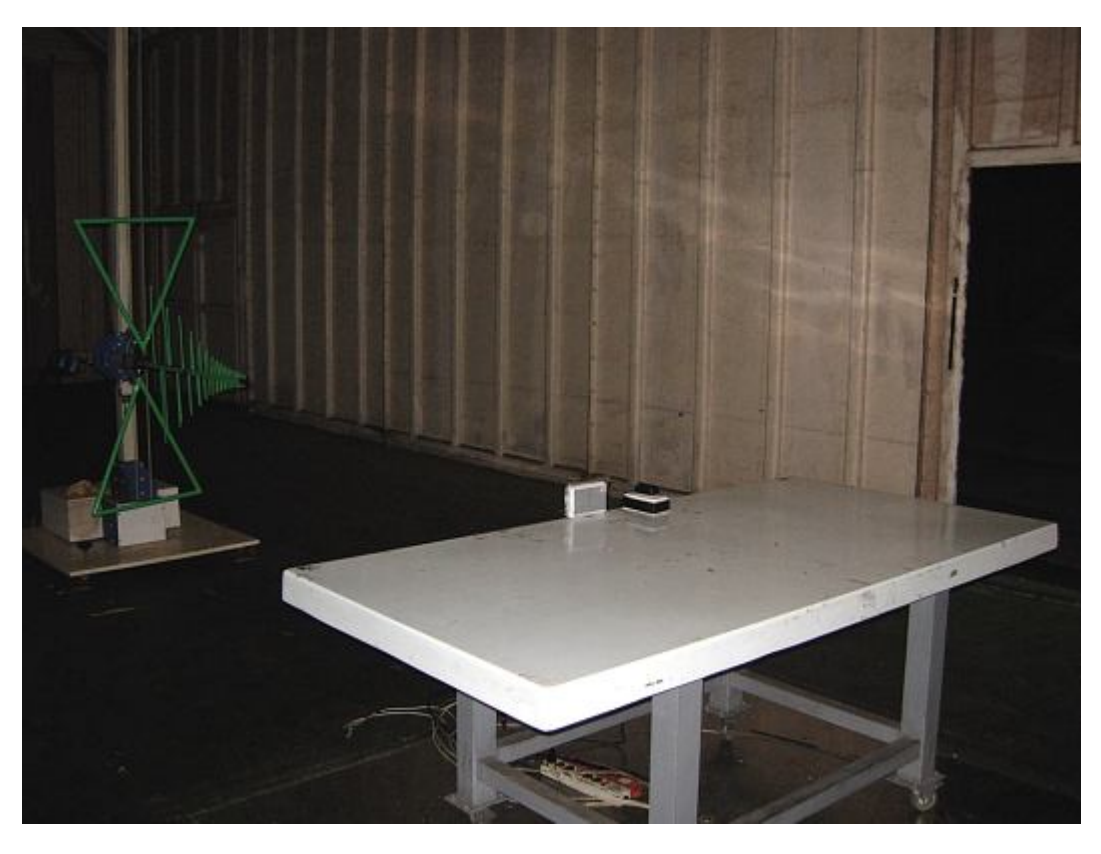
Front View of Radiated Test (with AC Adapter)