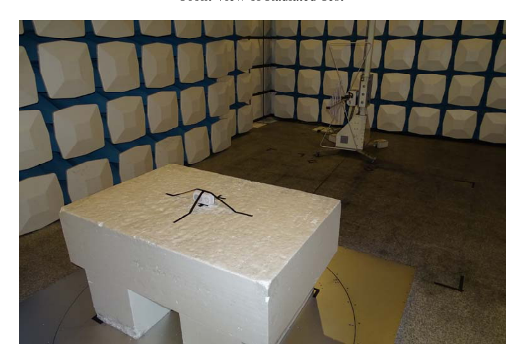
Back View of Radiated Test