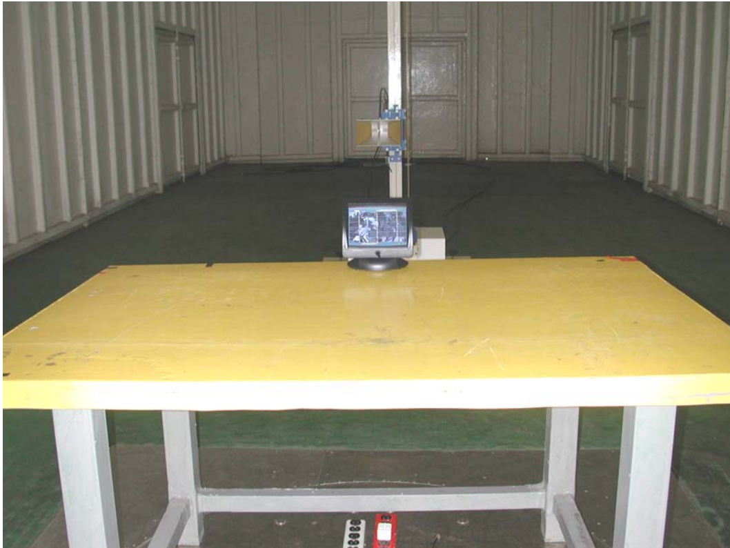
Back View of Radiated Test (Horn)