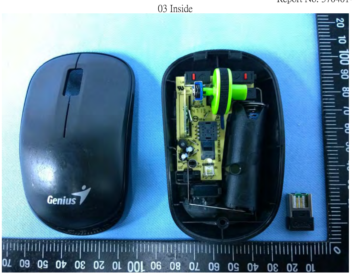
04 Front view of PCB