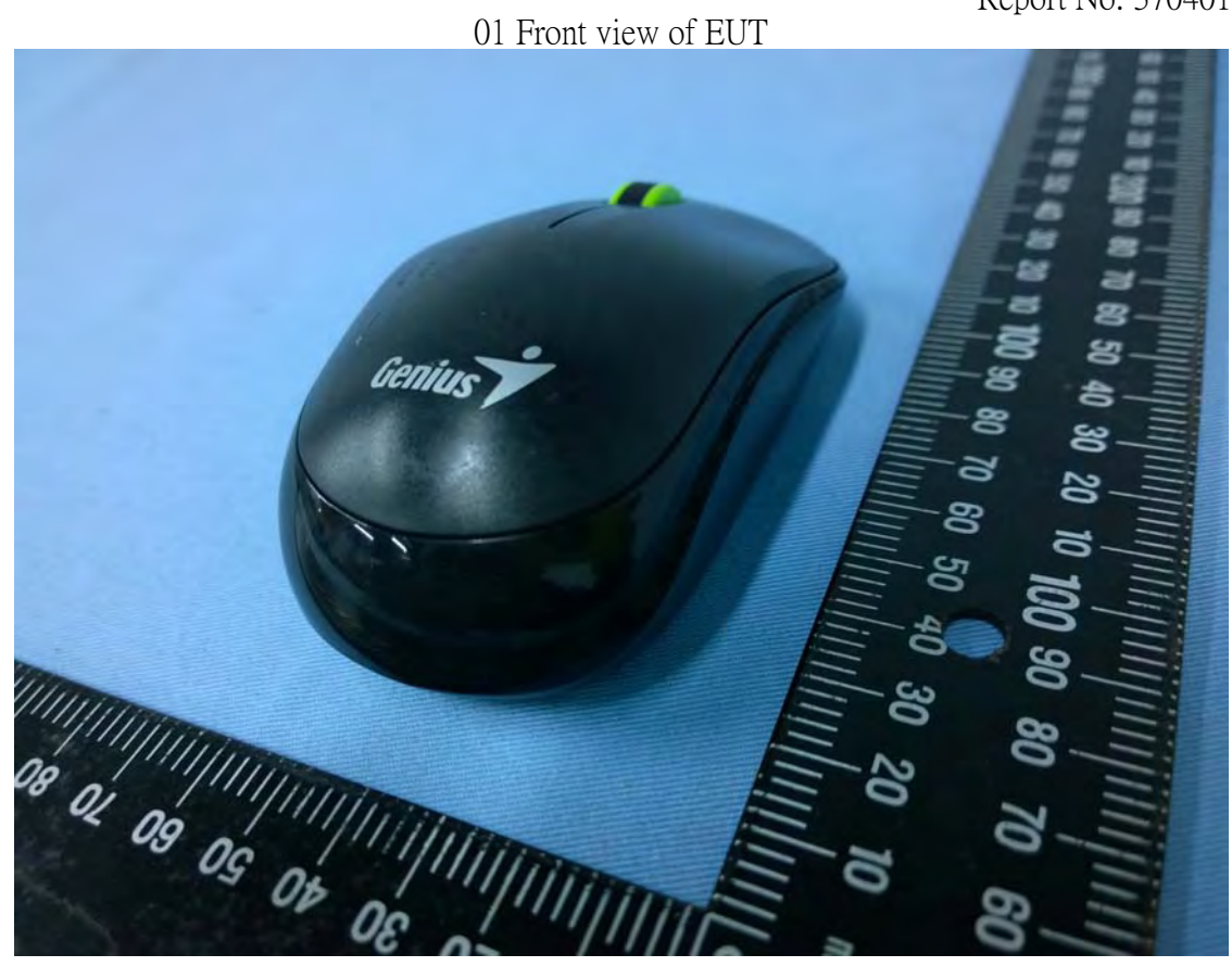
02 Rear view of EUT