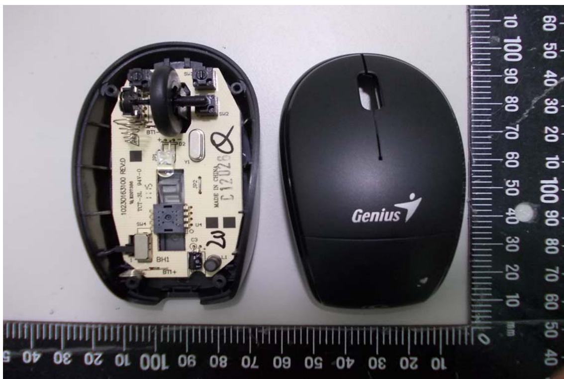
Inside View of EUT