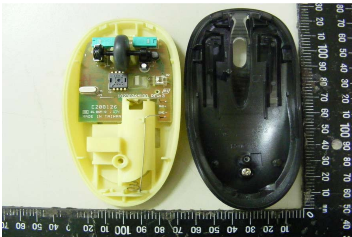
Inside View of EUT