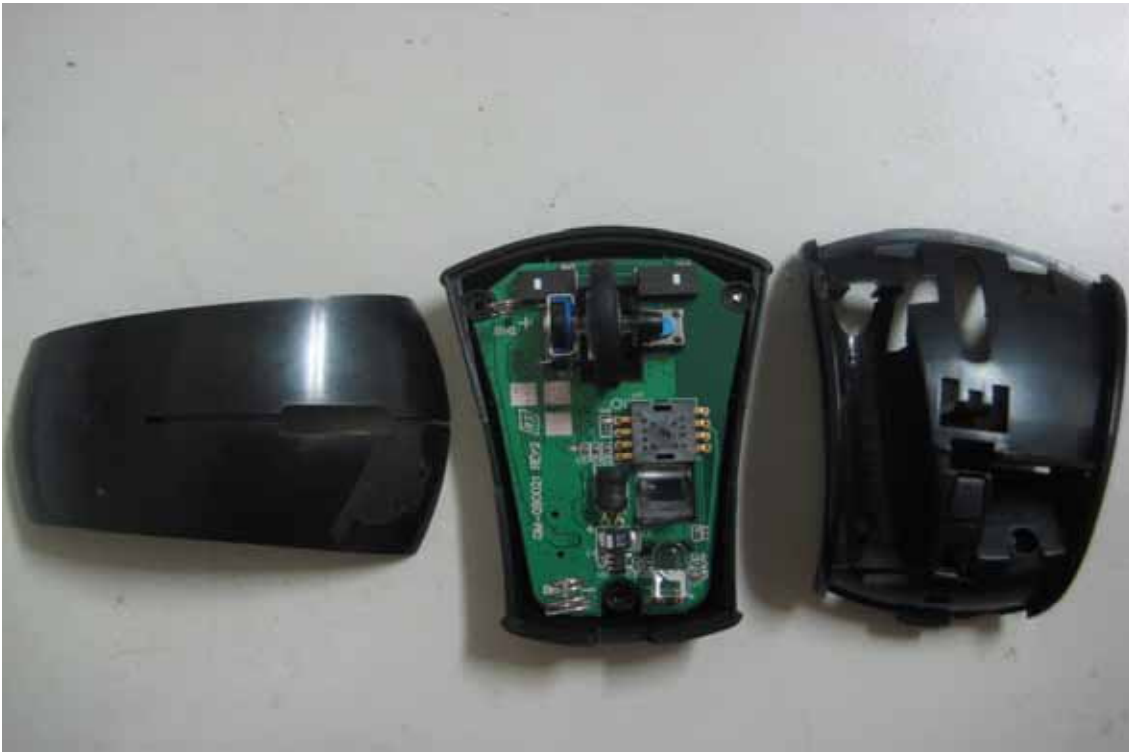
Inside View of EUT 1