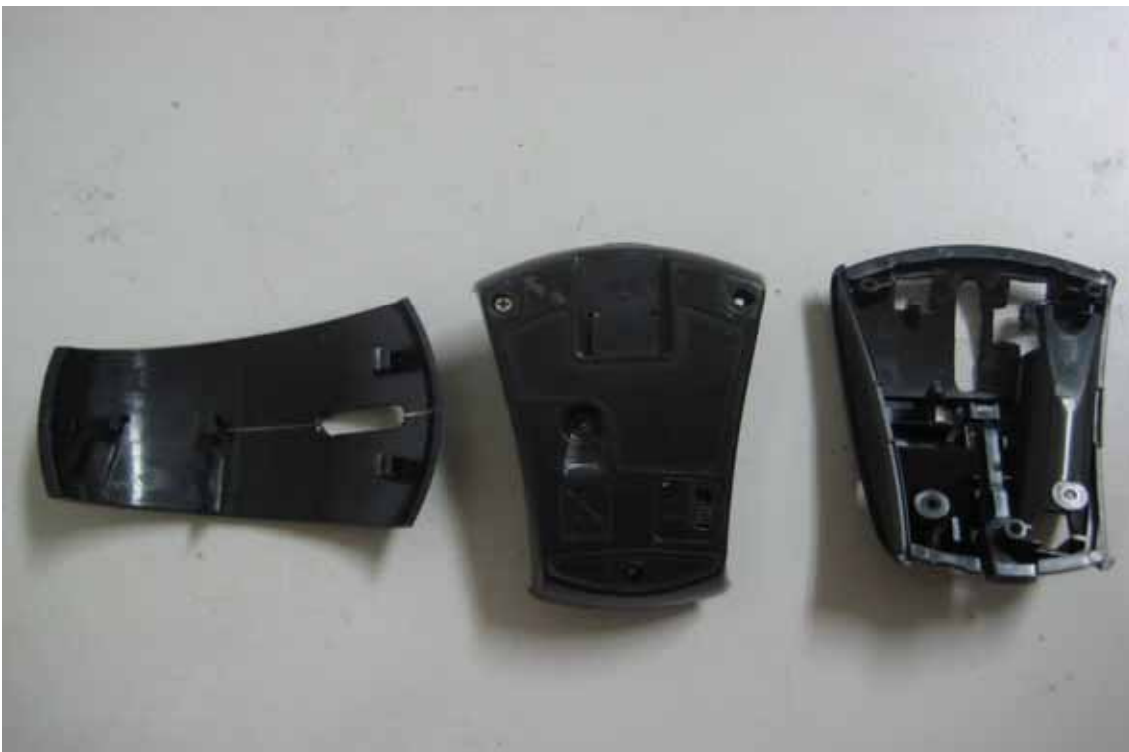
Inside View of EUT 1-1