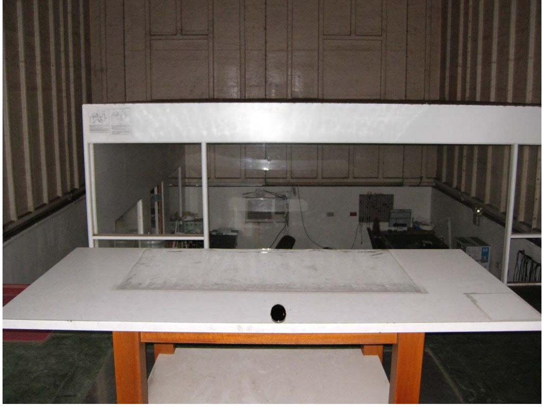
Front View of Radiated Test (Horn)