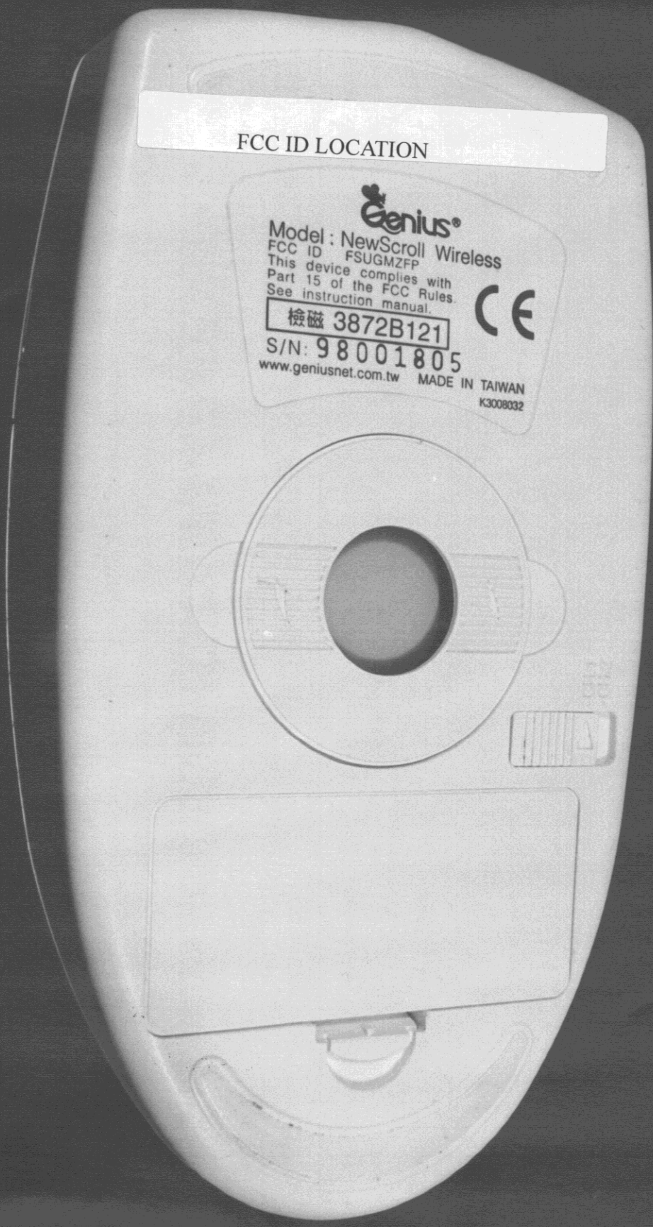
Bottom View Of The EUT