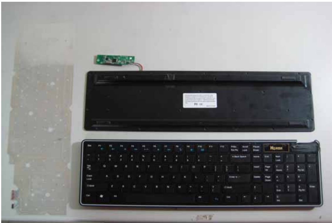
Inside View of EUT 1-1