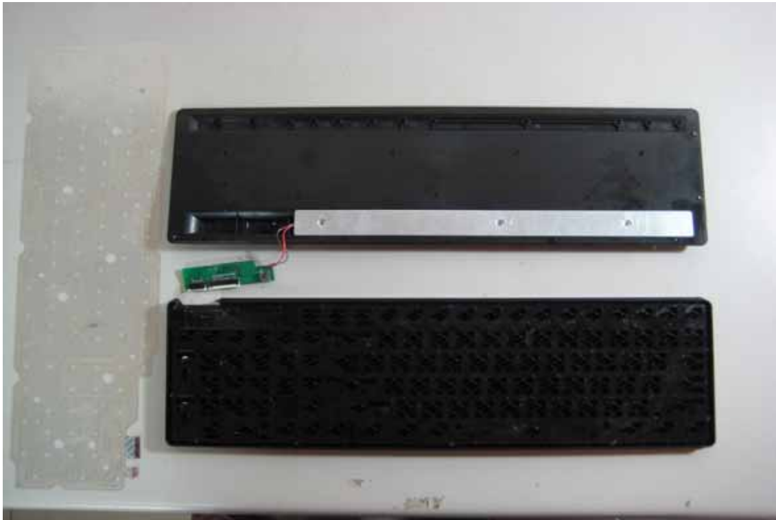
Inside View of EUT 1