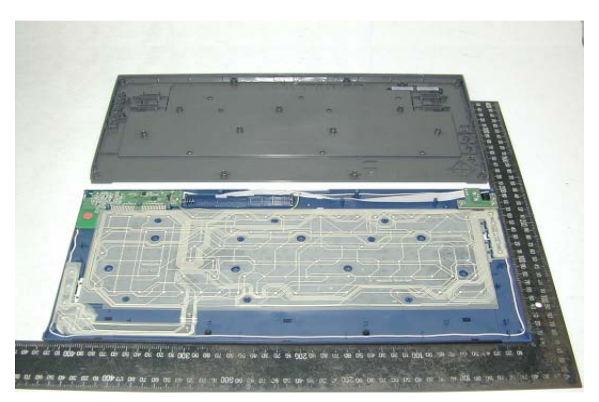
Inside View of EUT