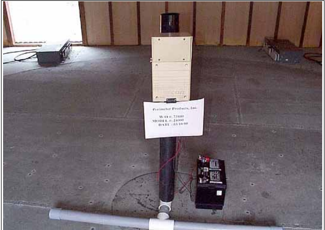
Radiated Emissions - Front View