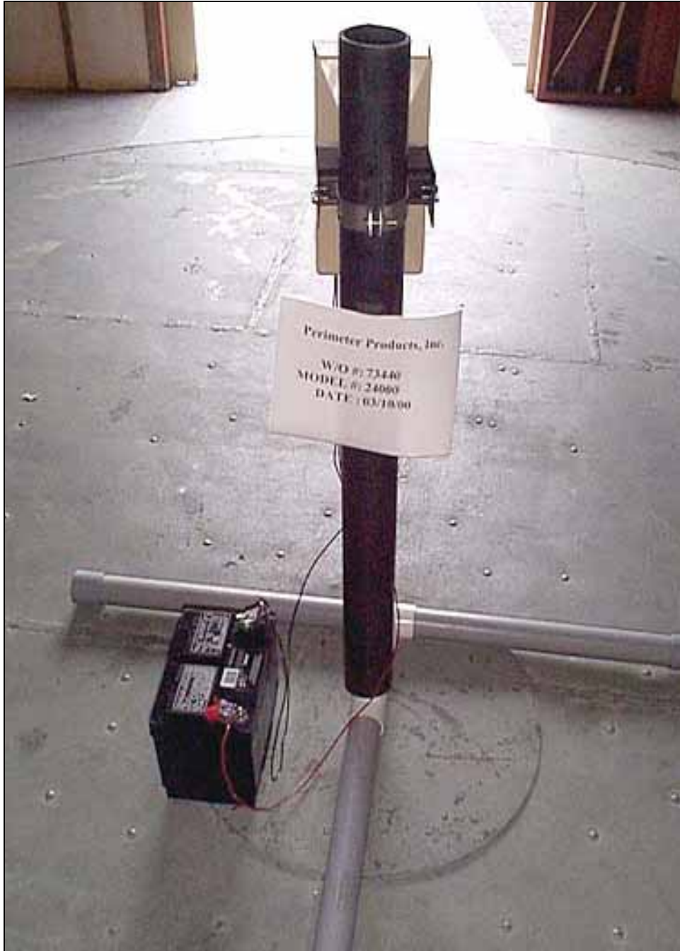
Radiated Emissions - Back View