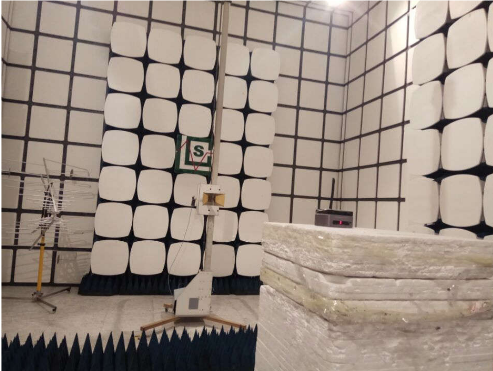
Radiated emission above 1GHz