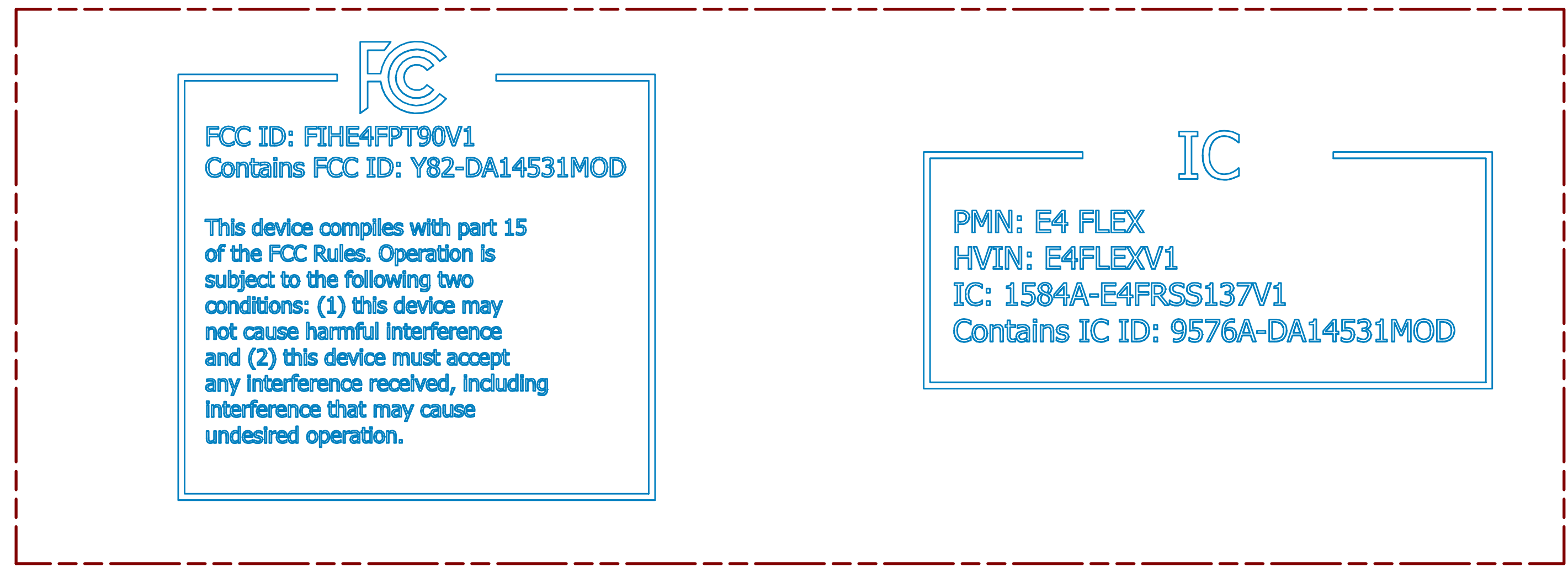
DETAIL B SCALE 3 : 1