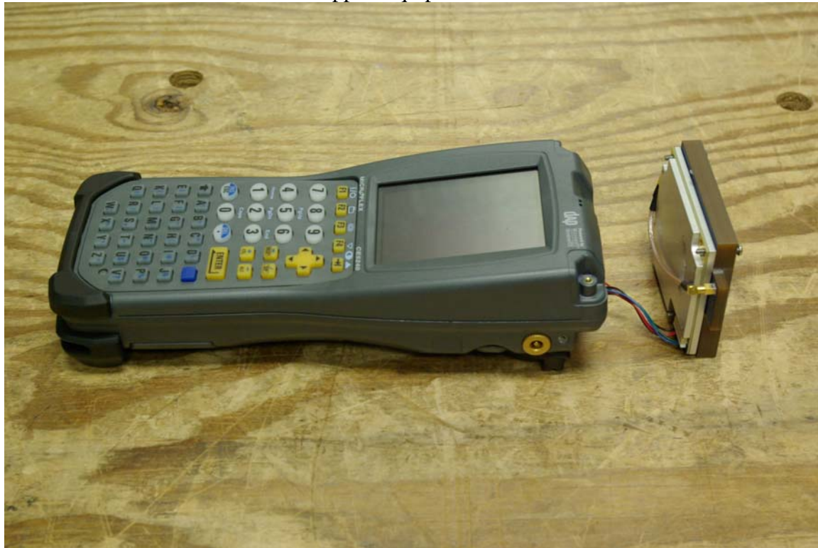
Module and plastic enclosure