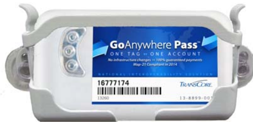
Figure 3 Correct Tag Orientation