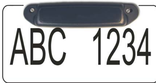
Figure 2 Placement Over the Upper Area of the License Plate

The license plate should have a 90-degree field-of-view to the overhead antenna as the vehicle approaches the toll plaza/gantry. If the vehicle bumper limits the field-of-view or if the license plate area is angled downward toward the pavement, you can use an angled mounting bracket to point the OBU upward to increase the field of view and improve performance ( Figure 3 ).