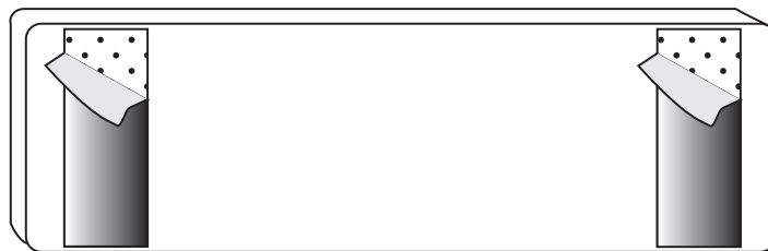
Figure 2 Peel backing from mounting strips to expose adhesive