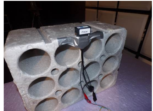
Test setup (1GHz-18GHz)