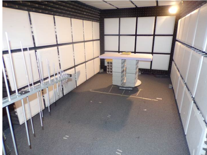
Test setup (9kHz-1GHz) for pre-scan measurement