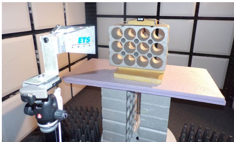
Test setup (18GHz-25GHz)