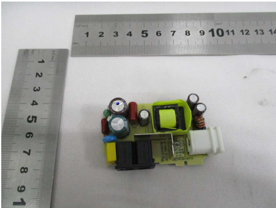
PCB of LED driver