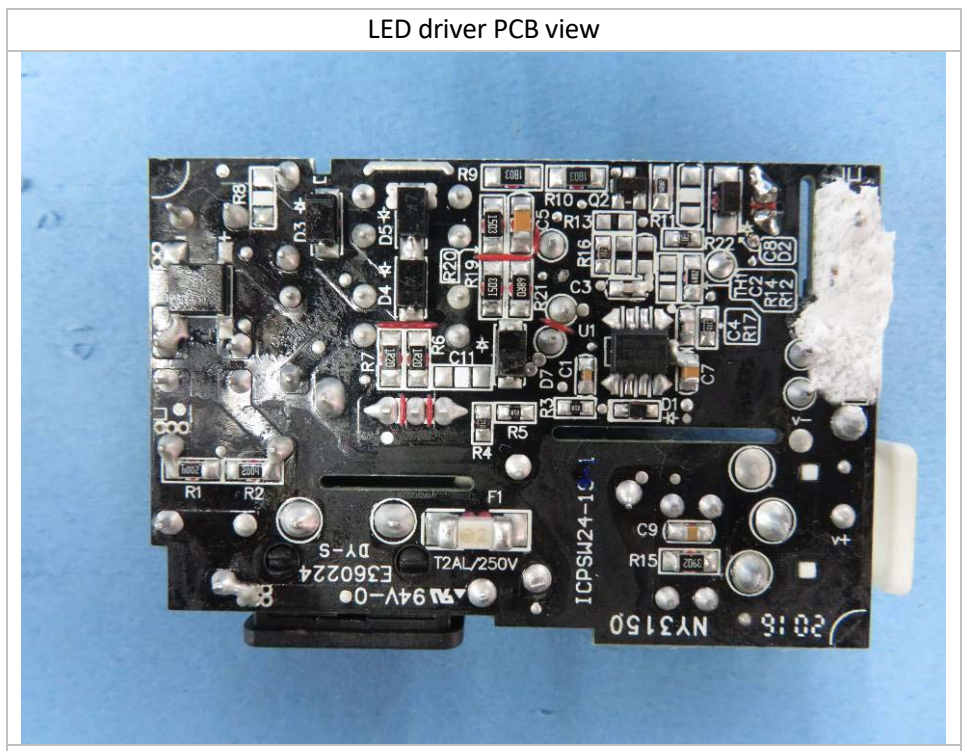
LED driver PCB view