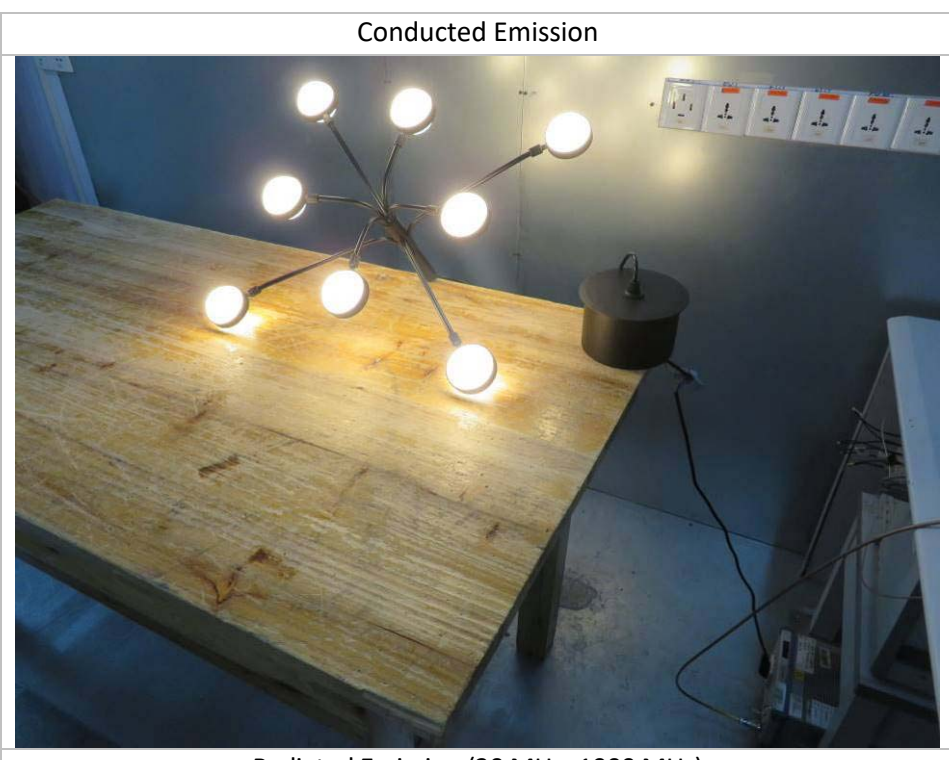
Radiated Emission (30 MHz-1000 MHz)