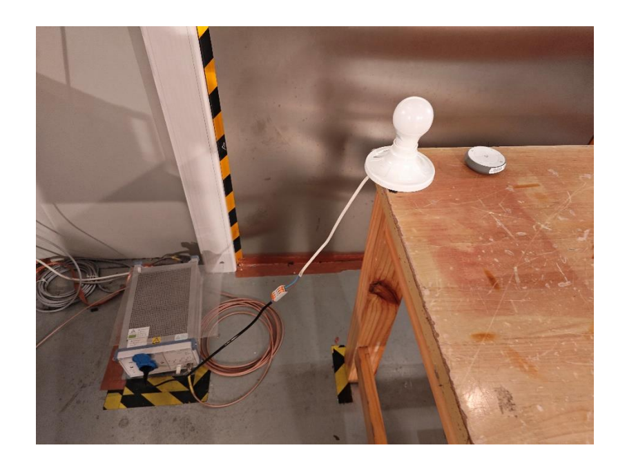
Photograph 2: Set-up for measurement of radiated emission (30-1000Mhz)