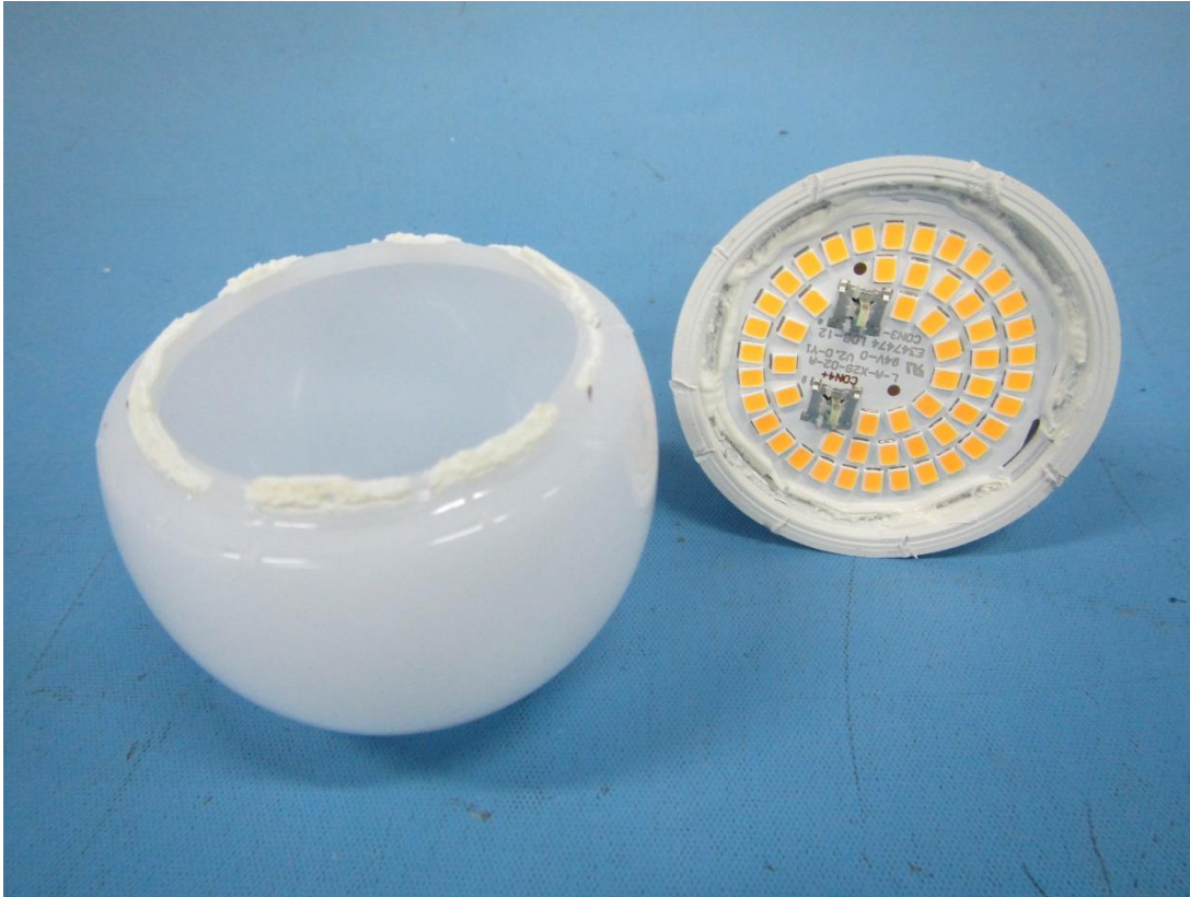
Photo 2 - Internal view