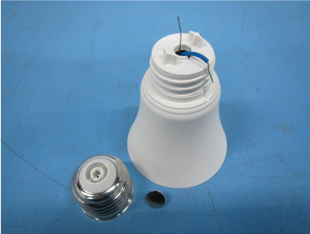
Photo 4 - Internal view