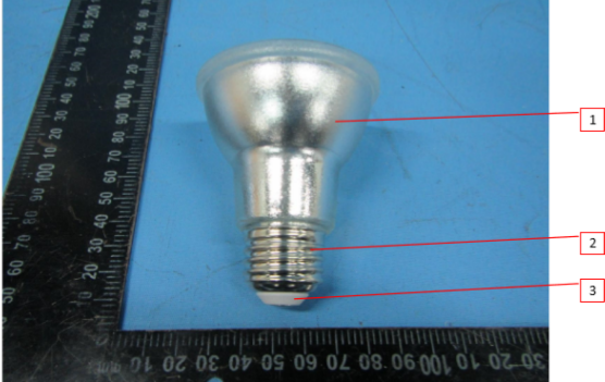
Photo 2 - External view