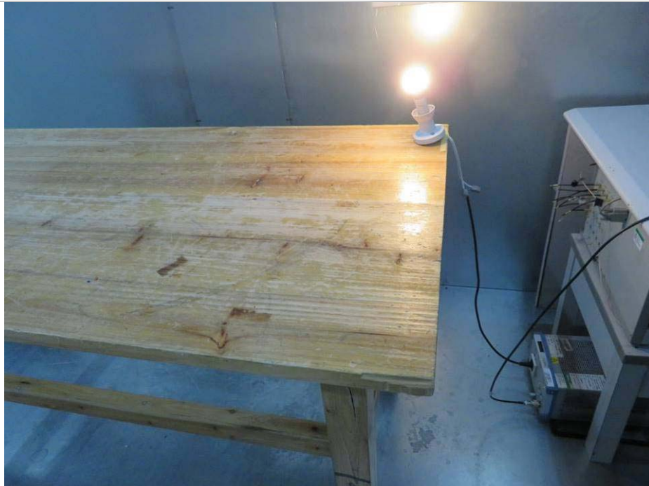
Radiated Emission (30 MHz–1000 MHz)