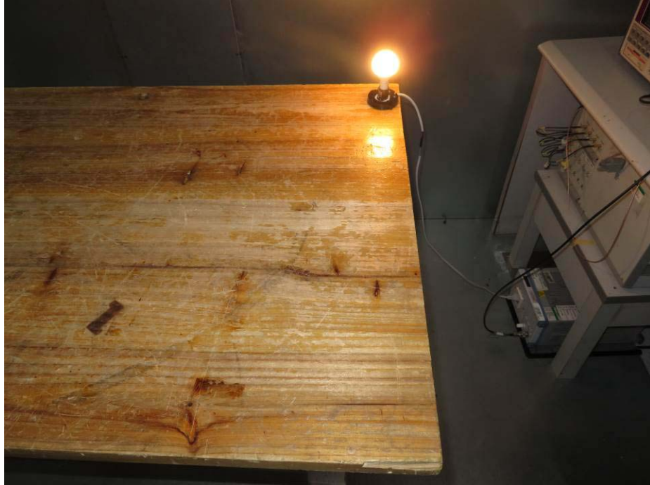
Radiated Emission (30 MHz–1000 MHz)