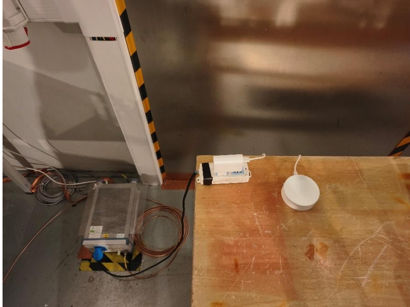
Photograph 1: Set-up for measurement of conducted emission